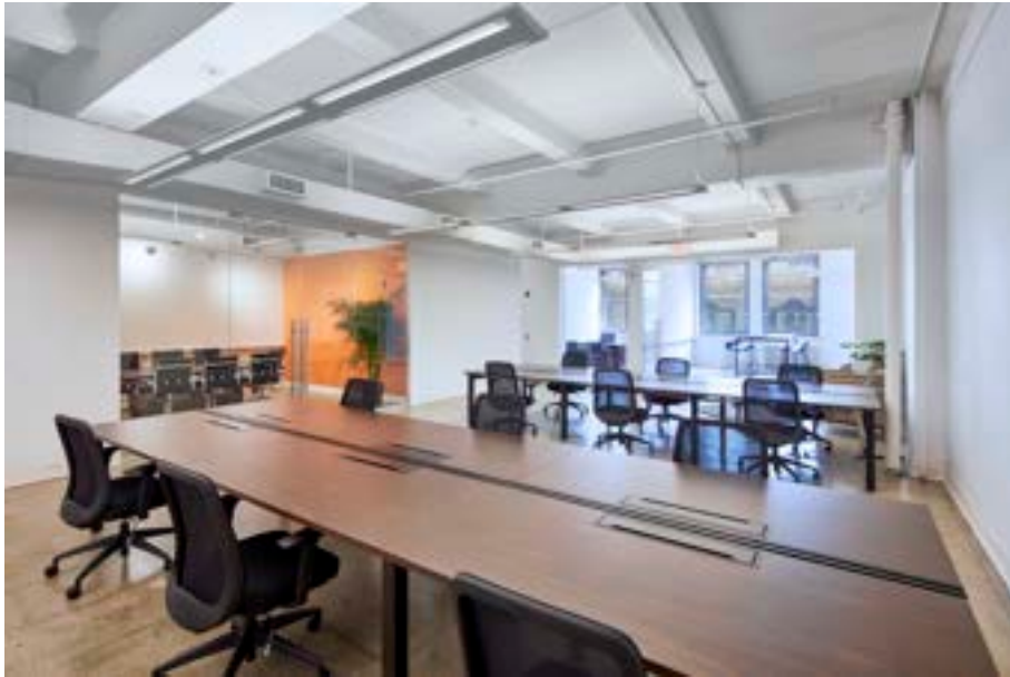
FULLY FURNISHED FULL FLOOR