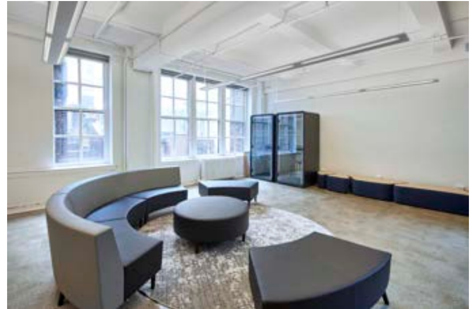
SOFT SEATING AND PHONE BOOTHS